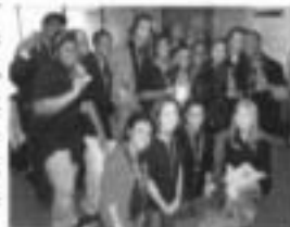
First Place Winners Riverwood High School

The Sankofa History Challenge is an exciting "quiz bowl" tournament that provides middle and high school students with an opportunity to publicly demonstrate their knowledge of African American history. This program, sponsored by KMT Community Development, Inc., a group of African American men committed to encouraging black youth, began with a pilot involving teams from the Metropolitan Atlanta Boys and Girls Clubs in 2006. Through a continuing partnership with the Auburn Avenue Research Library, the program has grown to what is now known as the Sankofa History Challenge. The primary purpose of this program is to celebrate African American History Month and more importantly, African American history itself. Indeed, it is impossible to fully understand the history of the United States of America without understanding the experiences and contributions of African Americans. A secondary purpose of this program is to reward students for the kind of academic preparation and teamwork that success in this event requires. In this sense, the program is about academic achievement and African American history. The SANKOFA HISTORY CHALLENGE also provides communities with an opportunity to celebrate student achievement in arenas other than athletics and entertainment.