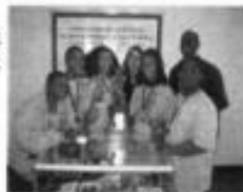
First Place Winners Inman Middle School Atlanta Public Schools

There is no doubt that next year's competition will keep pace with the excellent standards set thus far. Plans are underway to expand the contest to include schools from throughout the metropolitan area in 2009.